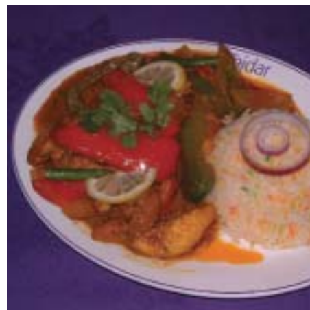
Murgh pahari sliced chicken tikka cooked in a tangy sauce of peppers, green chilli & mixed masala

Sliced chicken tikka cooked in a tangy sauce of green & red peppers, green chilli & mixed masala