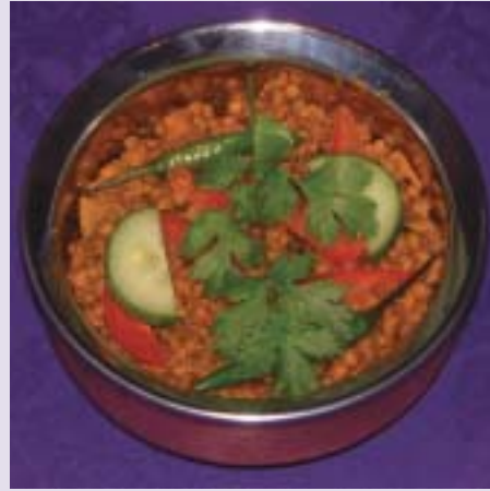
Chittal satkora freshwater fish, de-boned, minced, marinated in red chilli, mustard oil, tumeric & coriander, cooked with onion, garlic & satkora (a slightly bitter lime-like exotic fruit only found in Bangladesh) to give a subtle citrus flavour. See Tajdar special dishes

Enjoy the superb ancient cuisines of Bangladesh & India.