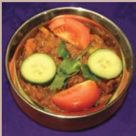
Bengal jalfar slices of fresh chicken or lamb tikka, cooked in a spicy, tangy, light sauce with fresh mushroom, garnished with coriander

Fresh king prawns lightly spiced & fried, prepared with fresh cauliflower, herbs & spices, a superb blend of ingredients & flavours