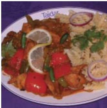
Shim fusili chicken or lamb tikka cooked in a rich sauce with green beans, garlic, red capsicum, tomato, basil & coconut milk, served with fusili pasta. See Tajdar special dishes