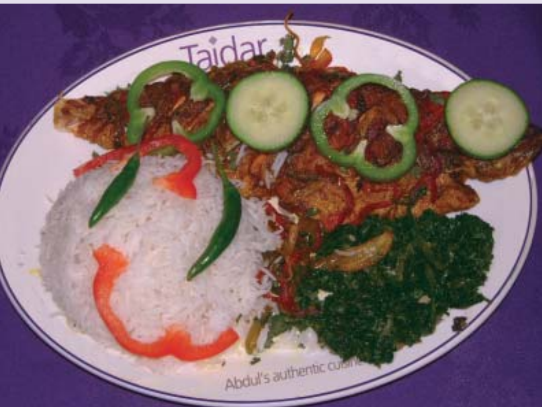
Trout biran special whole fresh trout, marinated in mustard oil, pan fried with tumeric, garlic & red chilli. Served with a thick sauce & spinach on basmati rice. See Tajdar special dishes