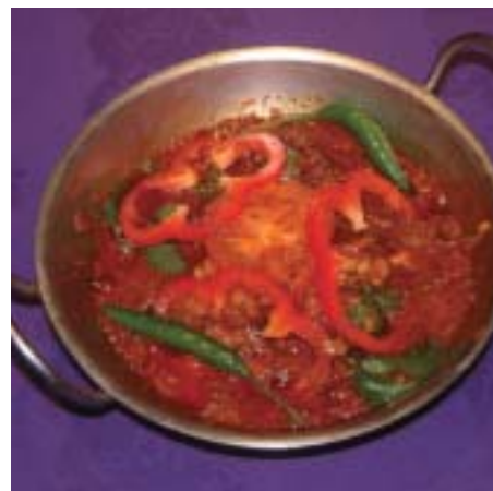
King prawn jalali superb prawns marinated & fried in ginger, garlic & coriander. Cooked in a rich sauce of red chilli & tomato. Garnished with fresh green chillies & pimento