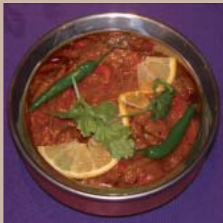
Tajdar special curry slices of roast chicken cooked in a medium hot sauce of capsicums, onions, ginger, green chillies & coriander