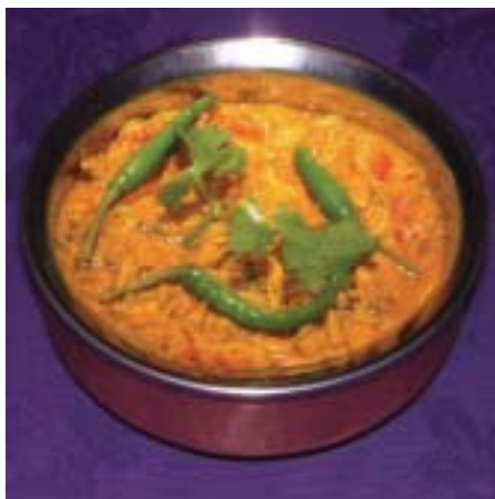
Murgh bhazzan strips of chicken breast cooked with onions, garlic & pimento. Medium spicy thick sauce & garnished with tomatoes & coriander. See Tajdar special dishes